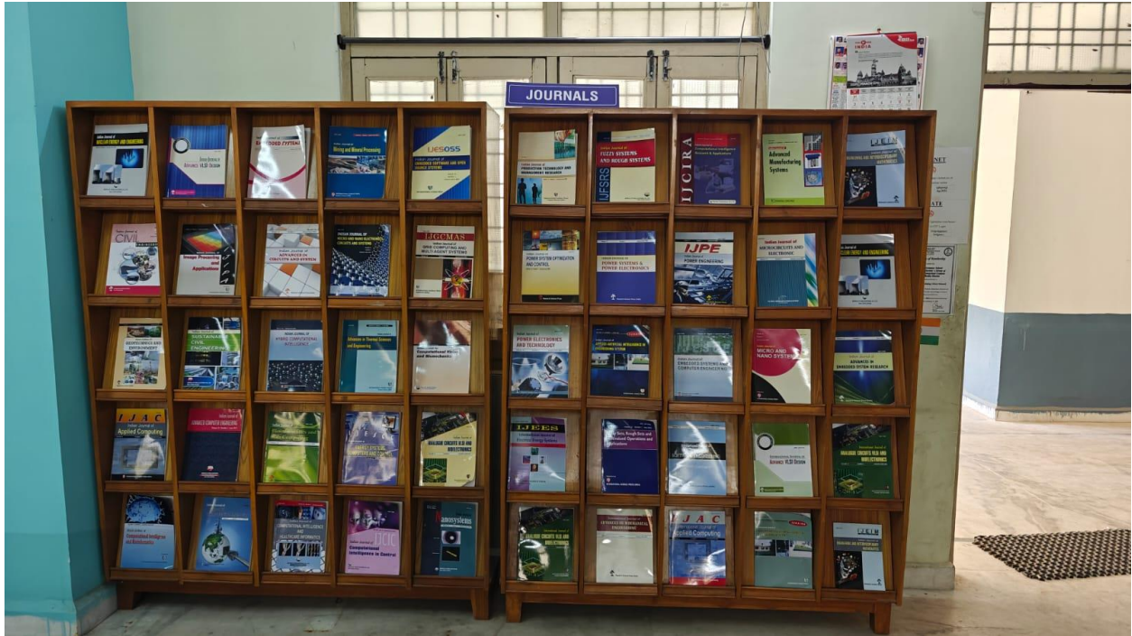
JOURNALS AT LIBRARY